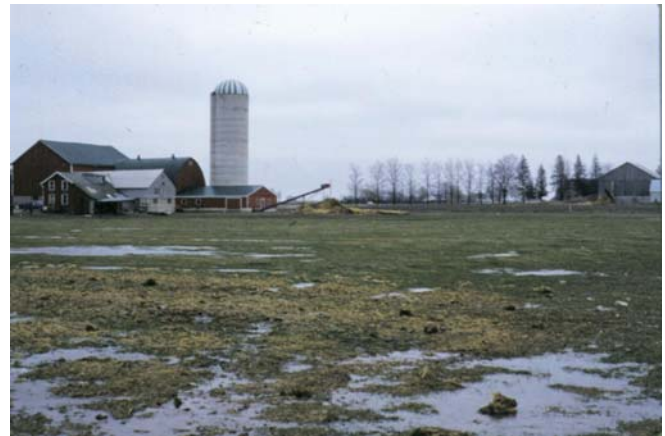
Figure 4 – Surface Water Has No Defined Course And No Right Of Drainage

Surface water has no defined course. See Figure 4. It is “the water that falls as precipitation, but which finds its way to a natural watercourse by percolation or flow”. Common Law can be confusing when it comes to surface water because, under most circumstances, it has no right of drainage and the law appears to deny the right of water to flow downhill. This is described further in this Factsheet.